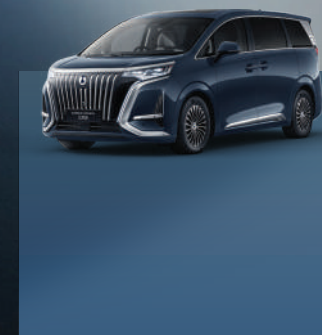
Whale Sea Blue